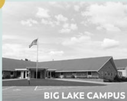
BIG LAKE CAMPUS